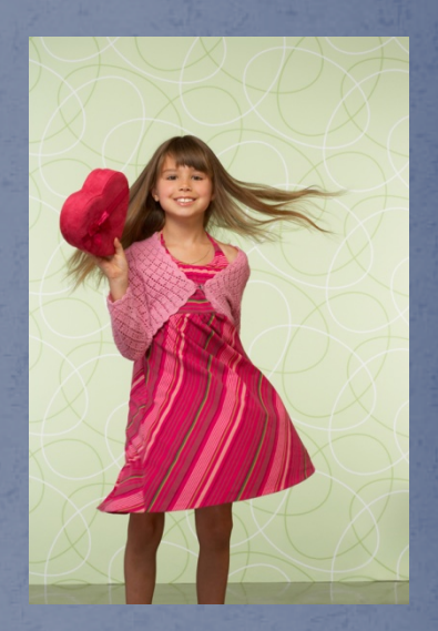
Heaven Is Where Your Heart Is

everything we most love and long for in earthly existence, we will find more intensely real in Heaven.