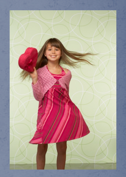
Heaven Is Where Your Heart Is

"Our citizenship is in heaven" now (Philippians 3.20).