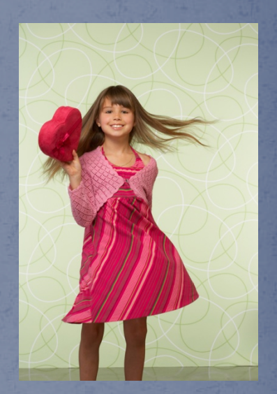
Heaven Is Where Your Heart Is

We live in two realms simultaneously, Earth and Heaven.